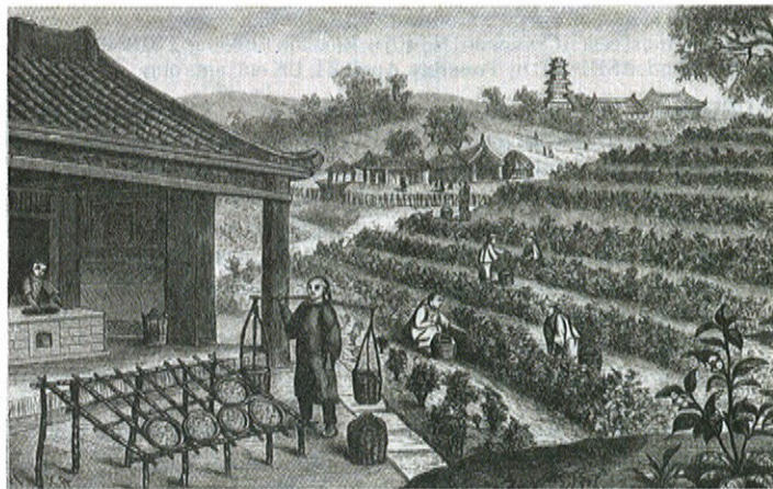
China's plantations have supplied tea for the English since 1650

Marcus Aurelius: Warrior, Philosopher, Emperor Frank McLynn (Bodley Head, £20)