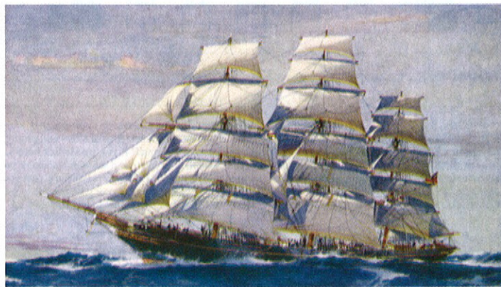
Tea clippers such as the Titania could cross the Atlantic in 14 days